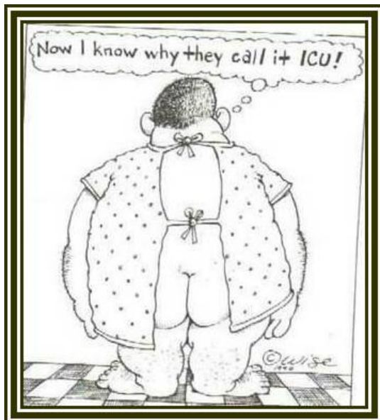
Answer: top puzzle 40, and the bottom puzzle 43

Two cannibals are eating a clown. One says to the other: Does this taste funny to you?