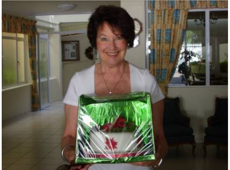
Mrs. Winner of our Christmas cake raffle. Over R750 were made with this fundraiser. Thank you to all who bought tickets.